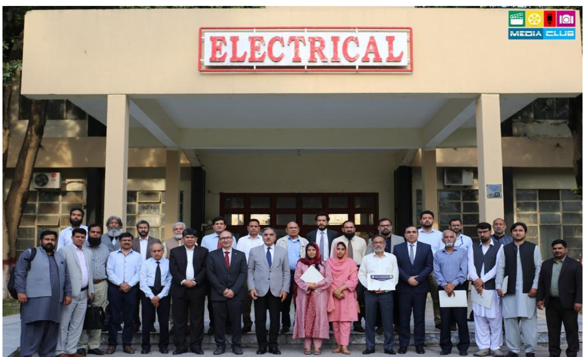
One Day Training for PEVs on May 2, 2023, at UET, Taxila