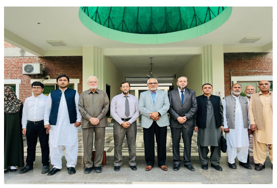
Accreditation Visit of Lahore Leads University (LLU), Lahore on Oct 21 and 22, 2022