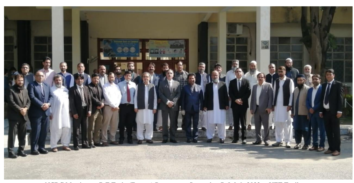
NCRC Meeting on B.E.Tech. (Energy) Program on September 7, 8 & 9, 2022 at UET Taxila