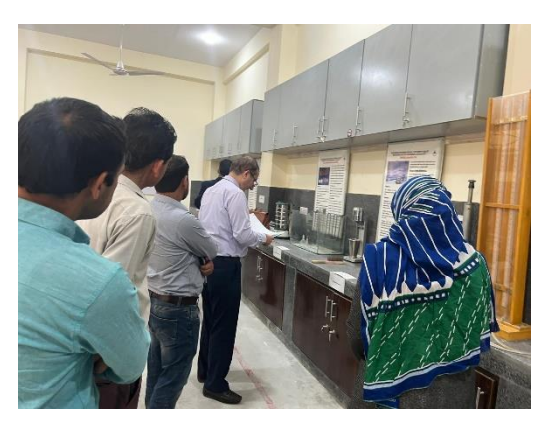
Accreditation Visit of Punjab Tianjin University of Technology (PTUT), Lahore on Dec 12 and 13, 2022