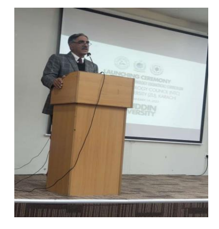
Launching Ceremony of B.E.Tech. (Biomedical) Program Curriculum at Ziauddin University Karachi on 18 January 2023