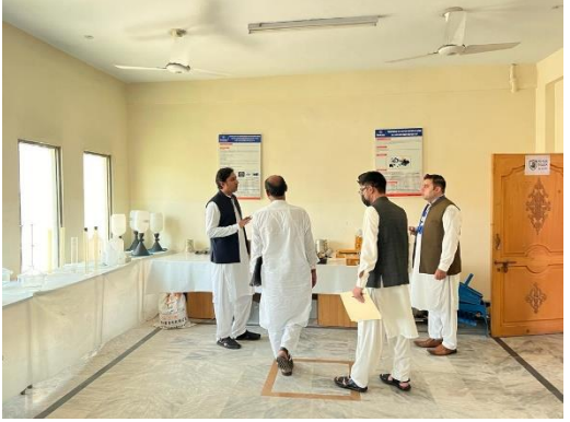
Clubbed Visit (Zero and Interim) at Brains Institute, Peshawar on Aug 19 and 20, 2022