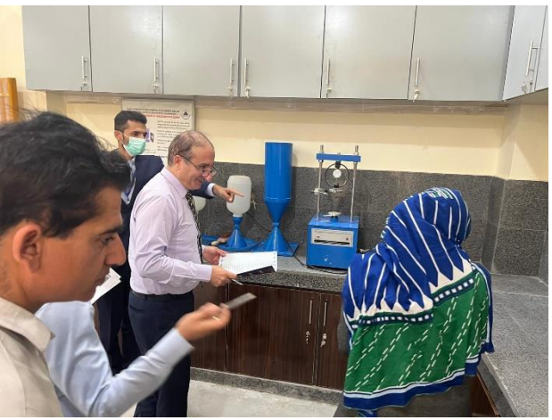
Interim Visit of Karakoram International University, Gilgit-Baltistan on Oct 6 and 7, 2022