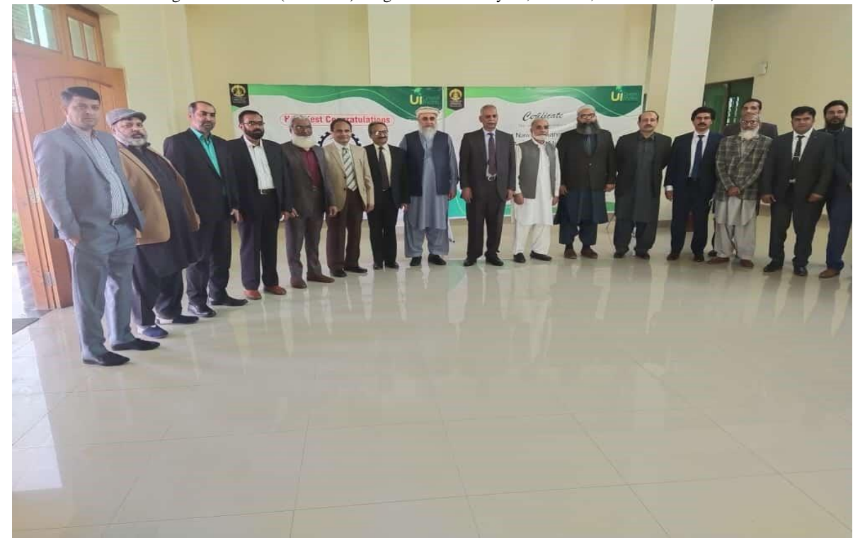
NCRC Meeting on B.E.Tech. (Information Security) Program March 1, 2 & 3, 2023 at UIT University, Karachi