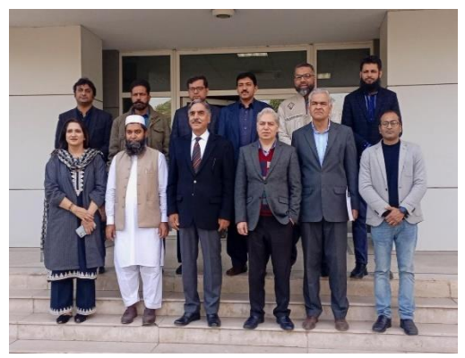
Launching Ceremony of B.E.Tech. (Textile) Program Curriculum at National Textile University Faisalabad on 3 Feb 2023