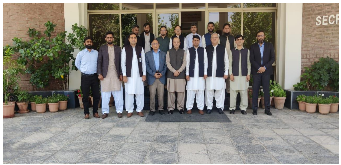
NCRC Meeting on B.E.Tech. Mechatronics Program on May 3, 4 & 5, 2023 at University of Wah