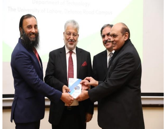
Launching Ceremony of B.E.Tech. (Electrical) Program Curriculum at University of Lahore on 20th December 2022