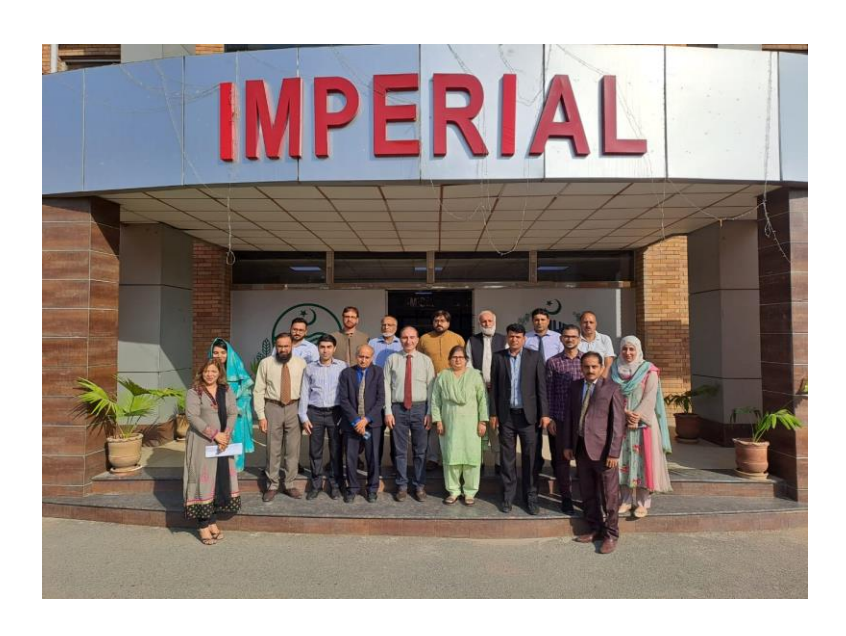
Zero Visit of Imperial College of Business Studies, Lahore on Jul 29 and 30, 2022