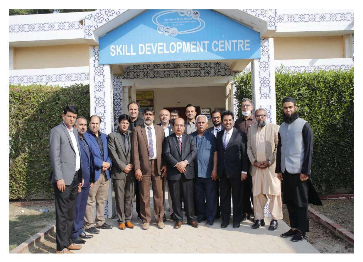
NCRC Meeting on B.E.Tech. (Software) Program on December 14, 15 & 16, 2022 at National Skills University, Islamabad