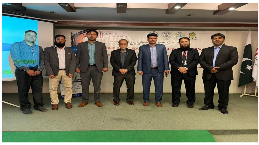
One Day OBE/A training to faculty members of GCTs and Sindh HEIs was held on 14th November 2022 in Indus University, Karachi