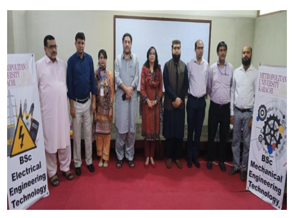
Zero Visit of Metropolitan University, Karachi on Aug 29 and 30, 2022