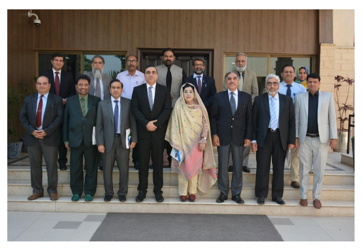
10th BOG Meeting of NTC was held on March 15th 2023