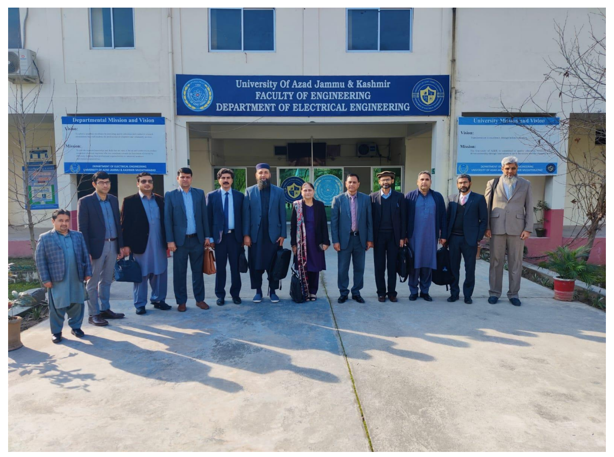
NCRC Meeting on B.E.Tech. (Industrial) Program on February 22, 23 & 24, 2023 at UAJ&K, Muzaffarabad