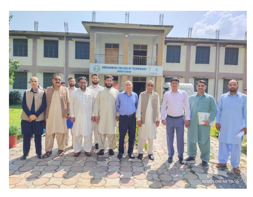
Zero Visit of Government College of Technology (GCT), Abbottabad on Sep 12 and 13, 2022