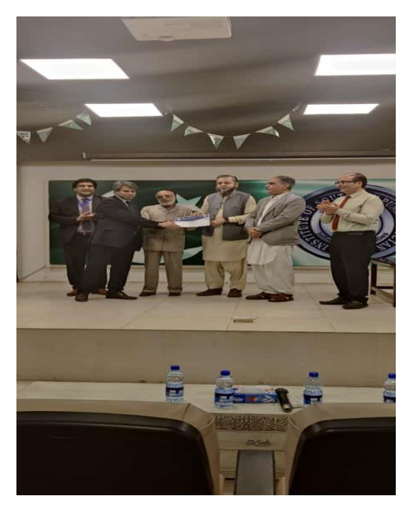
One Day Training for PEVs on June 16, 2023, at ISP, Multan